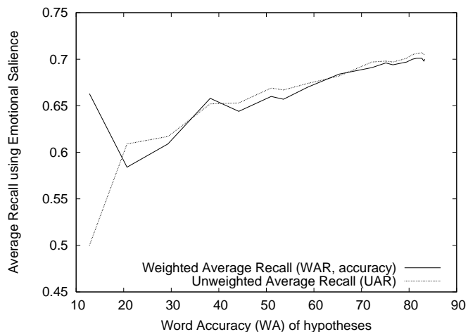
Figure 1: Recall versus word accuracy using 10-fold CV on the training data and an emotional saliency classifier trained on CMU/ T-Labs hypotheses.

To investigate robustness of the approaches, we report results on development and independent test sets. The development