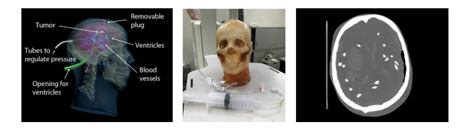
Fig. 1. The CAD model of the phantom, the experiment setting and an example slice of CBCT acquisition of the phantom are shown from left to right.

The clinical data used in this study was provided by our clinical partner. It comprised 3D DSA images acquired during tumor resection surgery of a glioma patient. The images were acquired preoperatively, following craniotomy, during resection, and postoperatively, to monitor blood flow within the brain during and after surgery. The surgery was performed in a hybrid operating room with Siemens Artis zeego system (Forchheim, Germany) and as with the phantom experiments, the acquisitions were reconstructed on a 512x512x398 grid with voxel resolution of 0.48mm<sup>3</sup>. We evaluated the proposed approach using the phantom